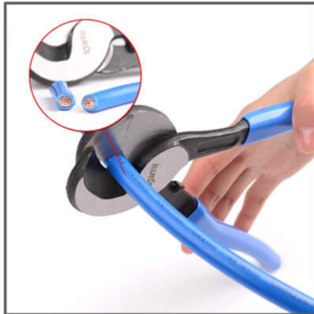
1. Cutting cable with the cable cutter included in the package in a appropriate length.