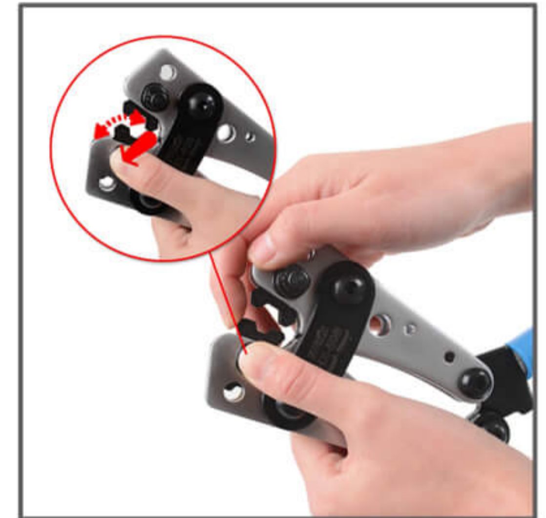
3. Push the bottom and roll the jaw to adjust the crimp jaws accordingly to lug size.