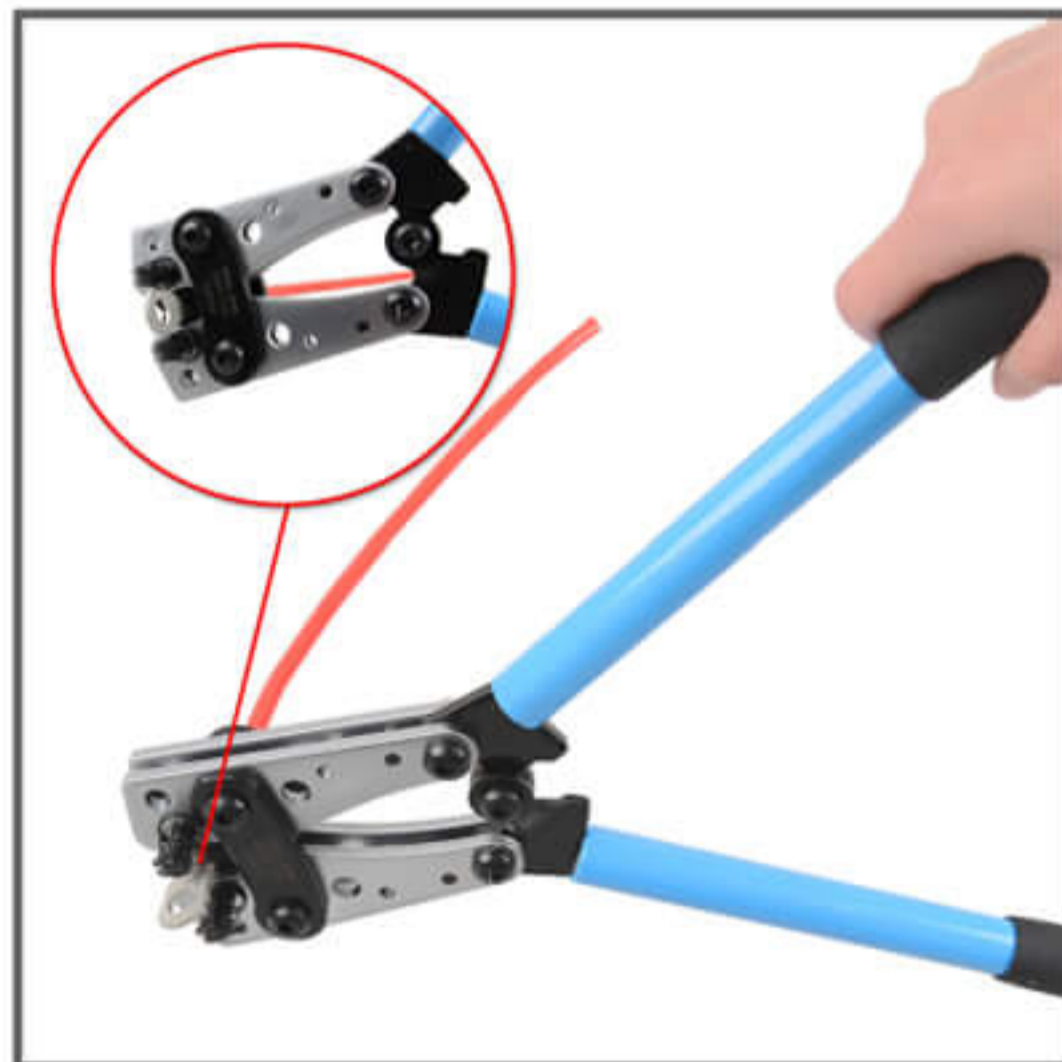
4. Insert the cable into the cable lug or connector to its full insertion length. Crimp the cable lug or connector with the correct jaws.