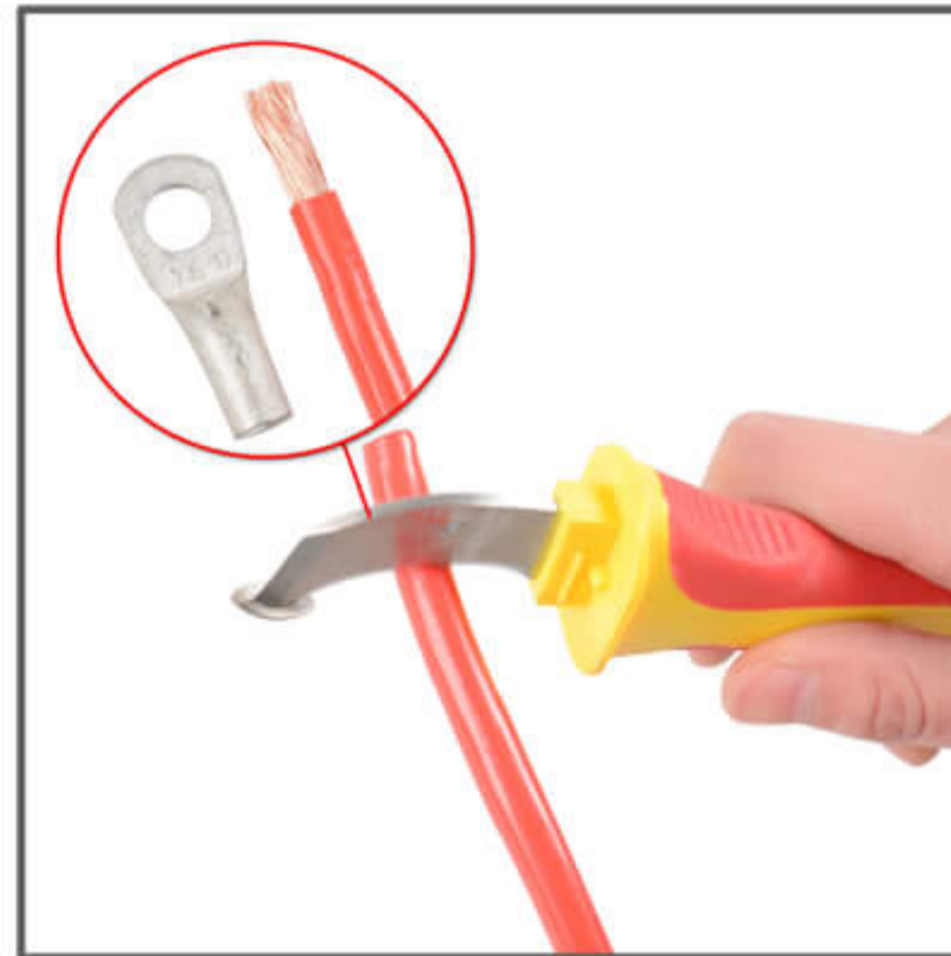
2. Before notching, the cable must be stripped according to the insertion.length (+10% due to change in length of the crimping sleeve.)